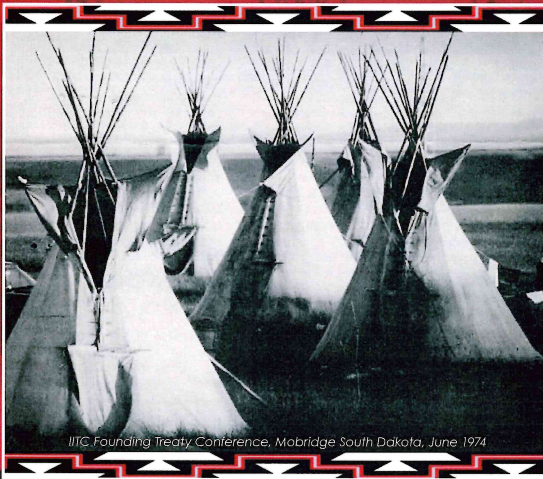
IITC Founding Treaty Conference, Mobridge South Dakota, June 1974

Wolakota Un Wichoni Kte Defending our Treaty Rights to Food, Water, and Health so that our Peoples will Live